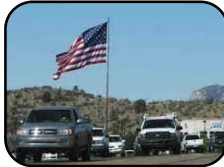
Lamb Landmark 50 foot American Flag

Lamb Chevrolet has generously contributed to our mission since 2018. Their employee giving program has continuously helped raise funds for Prescott Meals on Wheels. They match all donations that their employees donate throughout the year.